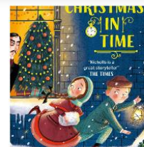
A Christmas in Time