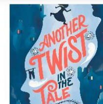
Another Twist in the Tale