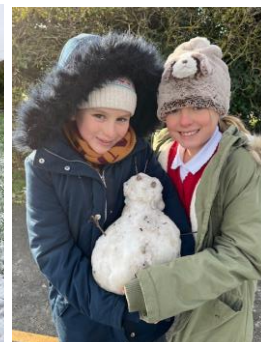
Photographs from the 'Snow Day'