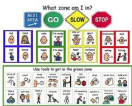
Zones of Regulation

Our Christian Values as the core foundation for behavioural expectations. Our Values guide pupils on how they can positively interact with one another in both our school community and in the wider world.