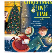
A Christmas in Time