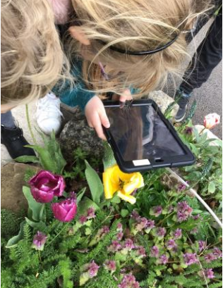
Eagle Owls exploring with their Little Owl buddies!